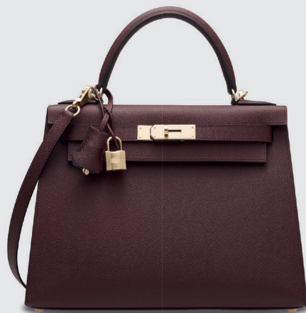
A CUSTOM BORDEAUX & GRIS MOUETTE EPSOM LEATHER SELLIER KELLY 28 WITH PERMABRASS HARDWARE HERMÈS, 2019

特別訂製波爾多紅色及海鷗灰色EPSOM牛皮 28公分SELLIER凱莉包附精銅配件 愛馬仕 2019