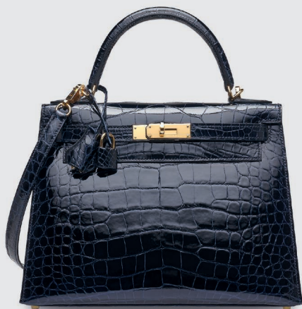
A SHINY BLEU INDIGO ALLIGATOR SELLIER KELLY 28 WITH GOLD HARDWARE HERMÈS, 2019